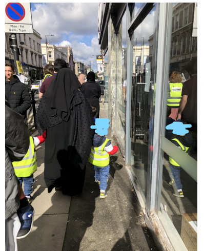
Walking bus for Mums with young children to get to Children's Centre sessions

Agility and culture change. Covid-19 forced us to rapidly change our operating model and make quick decisions, working closely with schools and re-orientating resource to focus on emerging need. This experience has equipped us well to respond to the sudden arrival of Afghan refugees at a Fulham hotel in August 2021 – 126 new residents in H&F who have arrived from Afghanistan, including 68 children [17 (0-5), 14 (5-10), 21 (11-15), 16 (16-18)]in Fulham.