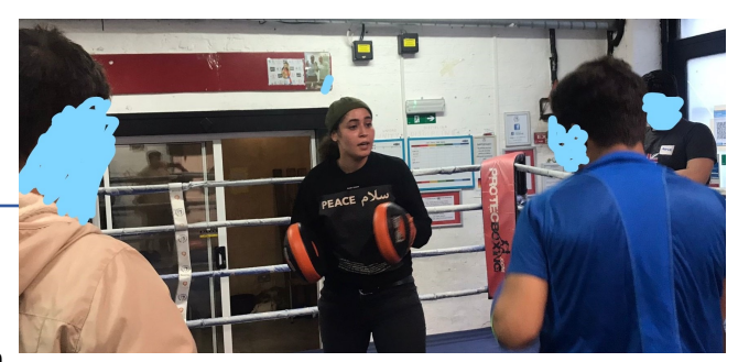
YP receive a boxing coaching session run by one of our youth providers.