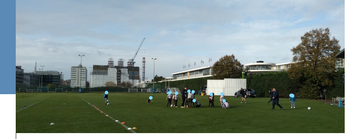
YP participate in extra-curricular sports run by a local VCS organisation

'Closer Look' 3 Response to Afghanistan Refugee Crisis